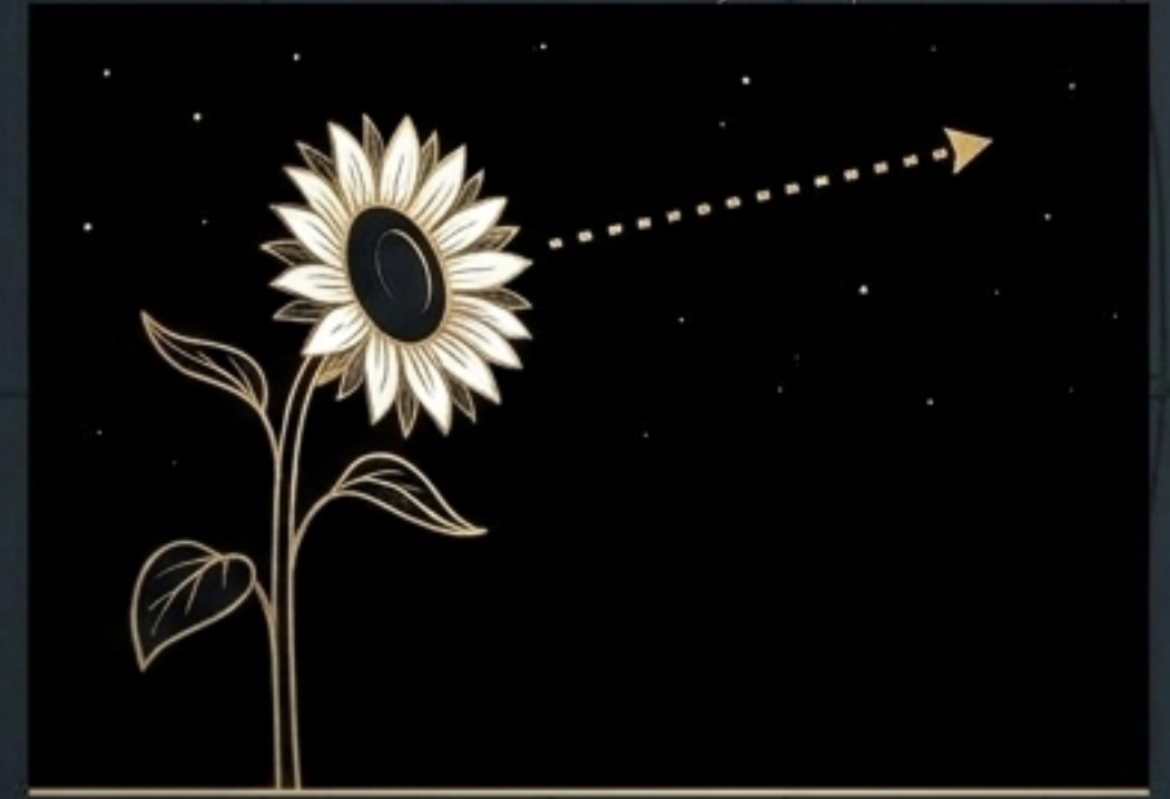
Midnight: Anticipating the East

It is not called a sunflower because it looks like the sun, but because it follows the sun. In the dark, it is not paralyzed by fear. It turns its head back to the East because it anticipates that the sun will rise again.