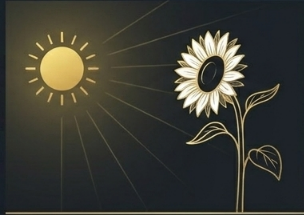
Evening: Facing West